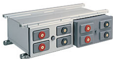
No specific photo available